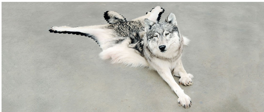
Figure 5: Nicholas Galanin, Inert , 2009.

various manifestations, offerings that are simultaneously full of divine beauty and reflective of worldly trouble: this is work out of this world and very much of this world . Indebted to histories and creators of new horizons, Black Constellation bestows art and practice for the Black, Brown, Indigenous, Subaltern; for those relations of the South-South, the internationalist, the native, the immigrant, the alien—those displaced from and without a home. In such a configuration, they constellate two worlds: one, a world sedimented out of histories of chattel slavery, colonial violence, imperialist wars, land dispossession, police violence, environmental degradation, forced migration, and resource extraction—all of the world’s old and new violations against its Black and Brown peoples; a second, an alternative, other-world, a vision that sees the present for what it is and constructs the future as a necessary inversion. Black Constellation is of an AfroFuturist sensibility, one that arrives as alien under conditions of alienation. In the face of such nods, forward and backward, historically and futuristically, the collective remains steadfastly in the present.