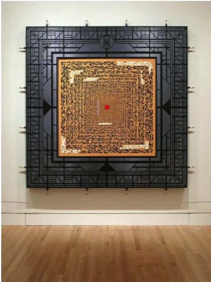
Figure 2: Nep Sidhu, Confirmation (A), 2014.