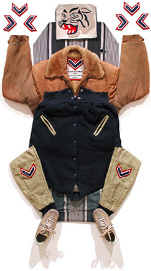
Figure 4: MaikoIyo Alley-Barnes, Wait! Wait! Don't Shoot (An Incantation for Jazz and Trayvon Martin) , 2014.