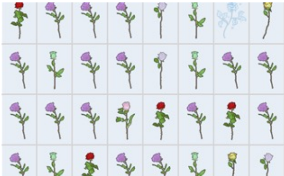
Figure 5.b: Filip Olszewski, Sister Unn's (2012)