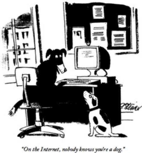
Figure 1: Peter Steiner ( The New Yorker , July 5, 1993)