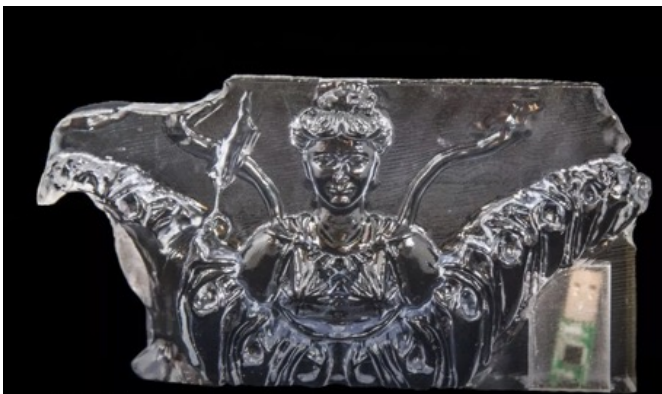
Figure 6.a: Morehshin Allahyari, "Material Speculation : ISIS—

Never opened to the public, pedestrians peered into the window to see drying flowers lining the abandoned shop's shelves and a single rose encased in a block of ice in an illuminated freezer. The work's title is from characters in "The Ice Palace" (1963), a classical literary work of Norwegian author Tarjei Vesaas that examines a community's process of mourning. The parallel site, www.sister-unns.com , features a digital rose database, professing catharsis by way of pastiche for a virtual tragedy.